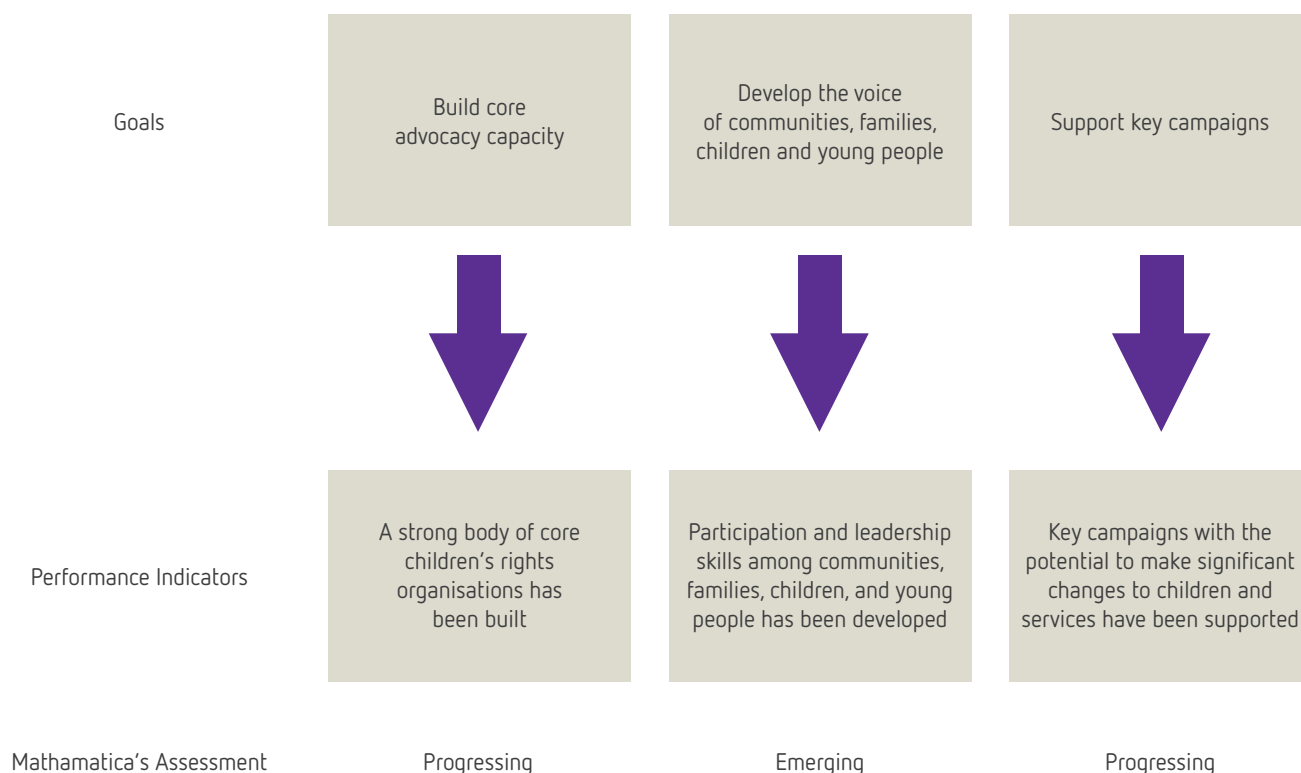
Figure III.1. Objective 2: Advance Children's Rights

Source: Atlantic Philanthropies' Children & Youth Programme 2011.